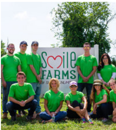
EisnerAmper Volunteer Team

"EisnerAmper Cares is involved with numerous volunteer events at various charitable organizations, but none are as special to me as our work with Smile Farms Inc., an organization that we have watched 'grow' since 2015."