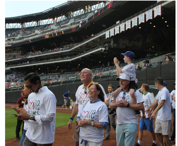
Smile Farms was honored at the Home Plate Ceremony.